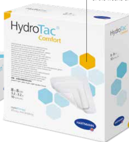
Coloured hexagon for the management of the properties of the wound dressing