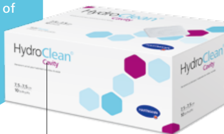
Product feature highlighted in colour